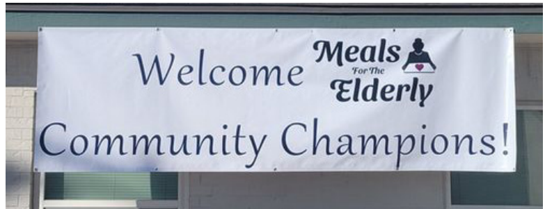
We want to thank all of the organizations and individuals that participated in our Community Champions Event! It was incredibly successful and we can't wait to do it again next year!

If your business or organization is interested in helping out with a drive, volunteering, or driving a meal route please contact our office at 325-655-9200. We wouldn't be able to operate without the help of our amazing volunteers and support from the community!