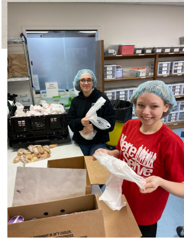
Students from Cornerstone Christian School helped assemble breakfast sacks that we sent out to recipients every Monday.