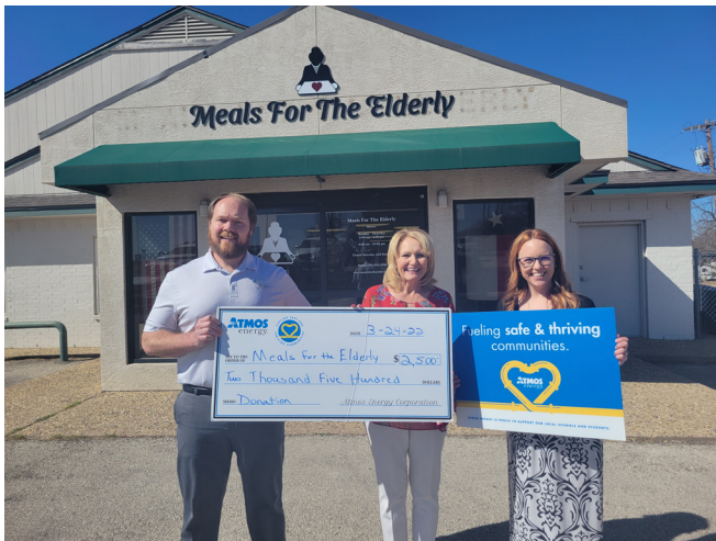
Atmost Energy supports local organizations and donated $2,500 to Meals For The Elderly

If your business or organization is interested in helping out with a drive, volunteering, or driving a meal route please contact our office at 325-655-9200. We wouldn't be able to operate without the help of our amazing volunteers and support from the community!