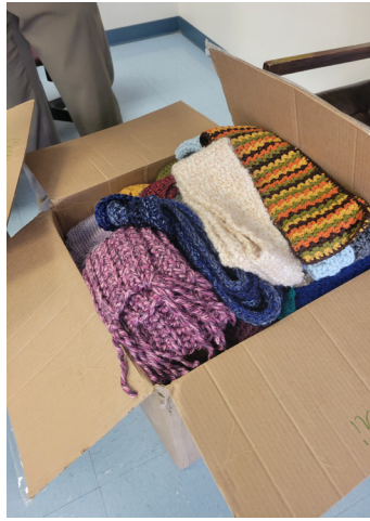
Warm Up America! Foundation is a group of volunteers from around the country that knit for a cause. The "Hop & Stitch" Group out of Grapevine sent us 100 hats and scarves for our recipients