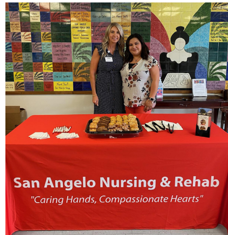
San Angelo Nursing & Rehab provided Coffee and Pastries to Volunteers in June.

If your business or organization is interested in helping out with a drive, volunteering, or driving a meal route please contact our office at 325-655-9200.