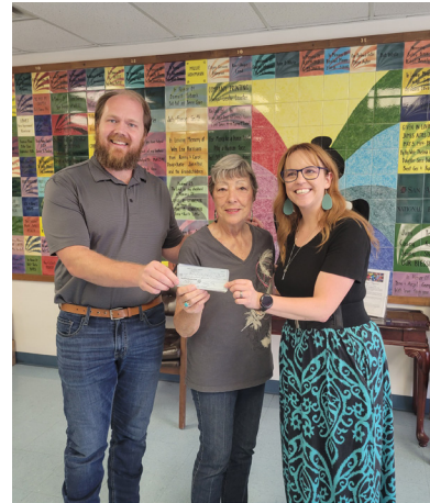
The San Angelo Gun Club held a benefit shoot for Meals For The Elderly.