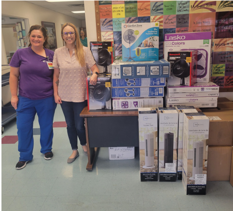
Encompass Health did a fan drive to help us provided fans for recipients that need them during the hot summer months.

Local Businesses and Organizations that support Meals For The Elderly