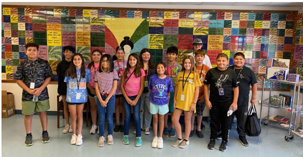
Students from the ADACCV Summer Youth Camp packaged snacks and filled lunch sacks.