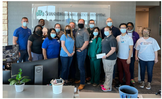
Encompass Health did a fundraiser to benefit Meals For The Elderly.